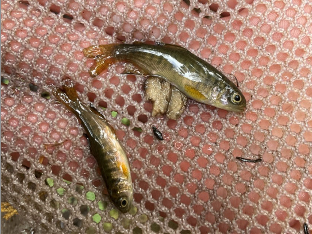
Figure 1.—Juvenile coho salmon captured at waypoint 1572.