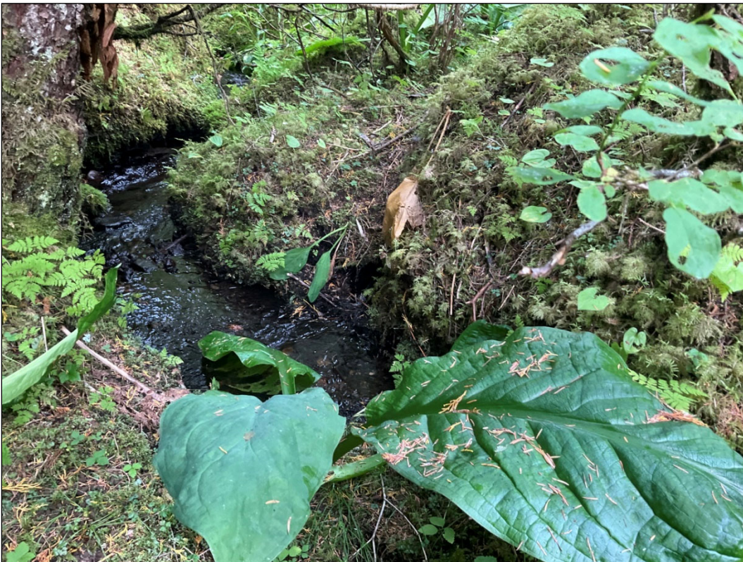
Figure 2.—Tributary 2 at waypoint 1570.